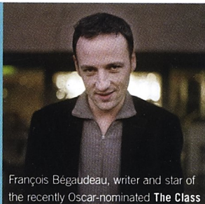
François Bégaudeau, writer and star of the recently Oscar-nominated The Class